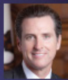
Governor Gavin Newsom

the following State Constitutional Candidates for the 2018 elections