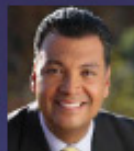
Secretary of State Alex Padilla