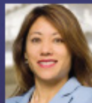
Treasurer Fiona Ma