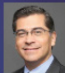
Attorney General (Dual) Xavier Becerra